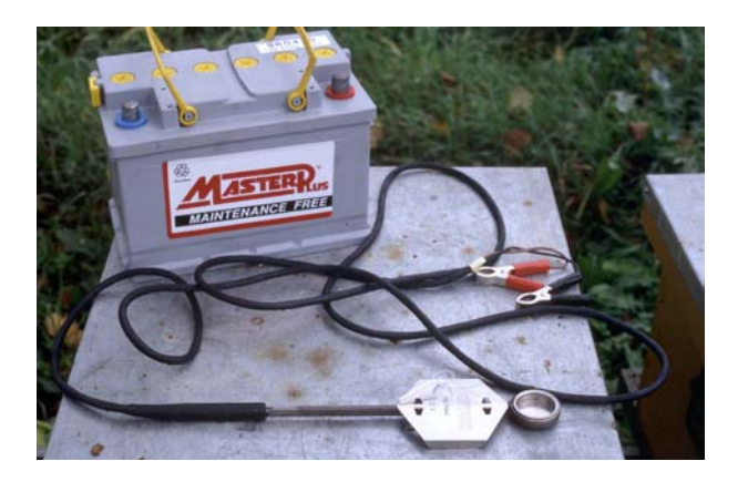
Figure 1: Varrox® device.

The trials are been carried out during November and December 2003 in the experimental apiary of Istituto Sperimentale per la Zoologia Agraria, Sezione di Apicoltura, located in Tormancina (Rome). The treatments are been carried out on broodless colonies. Three groups of ten colonies, selected for their strength calculates in numbers of frame of adult bee and brood, are been tested and disposed in DB beehives with 10 frames and movable